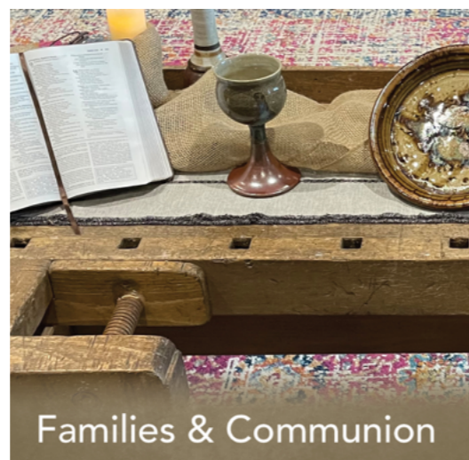
Families & Communion

October 3 is Family Worship & World Communion Sunday. Invite a friend or neighborhood family to join you.